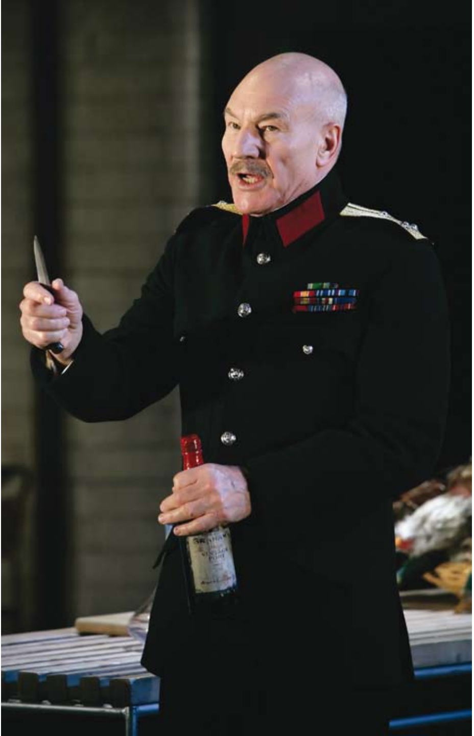
Patrick Stewart (as Macbeth), Chichester Festival Theatre.